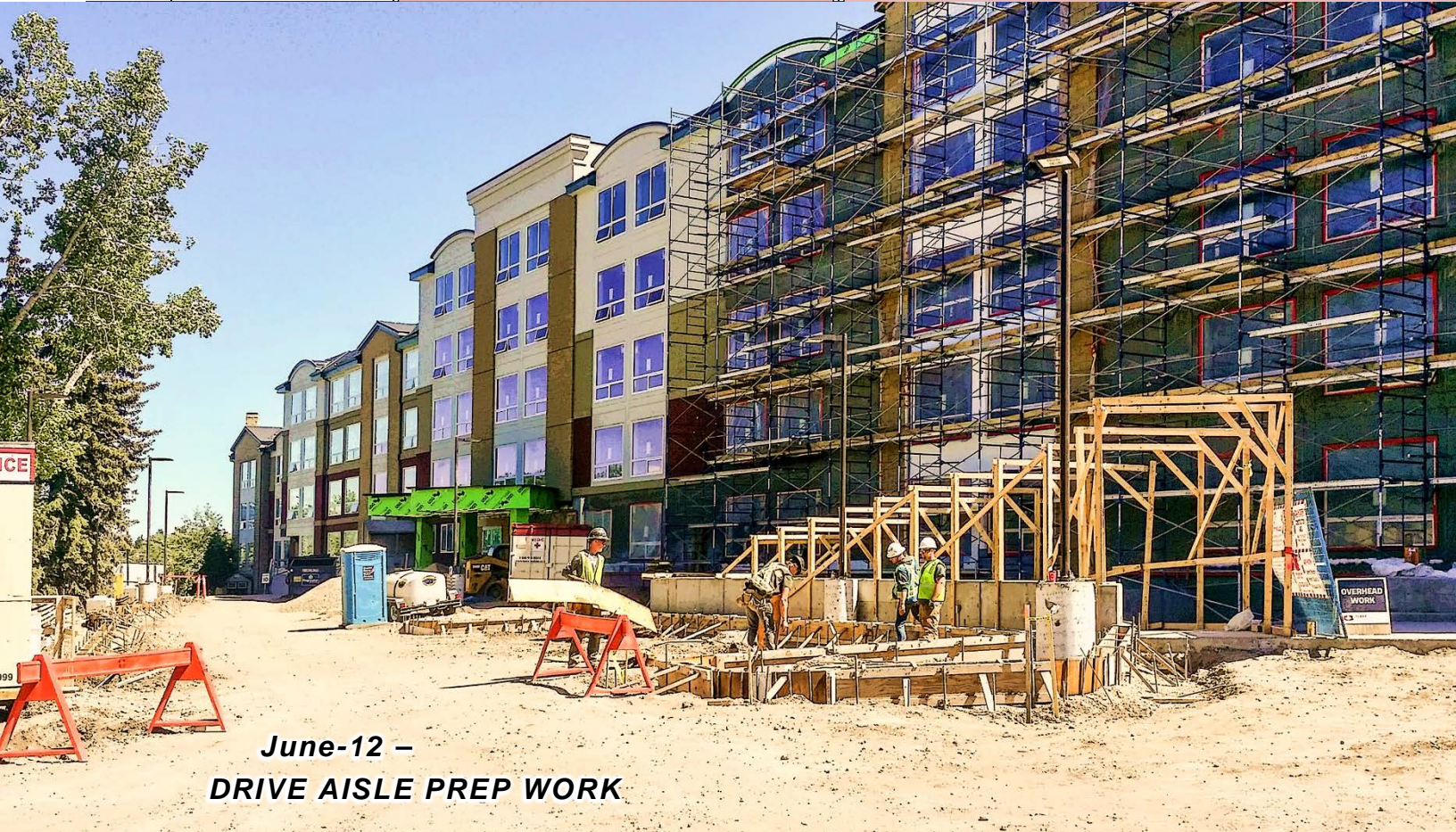
June-12 – DRIVE AISLE PREP WORK