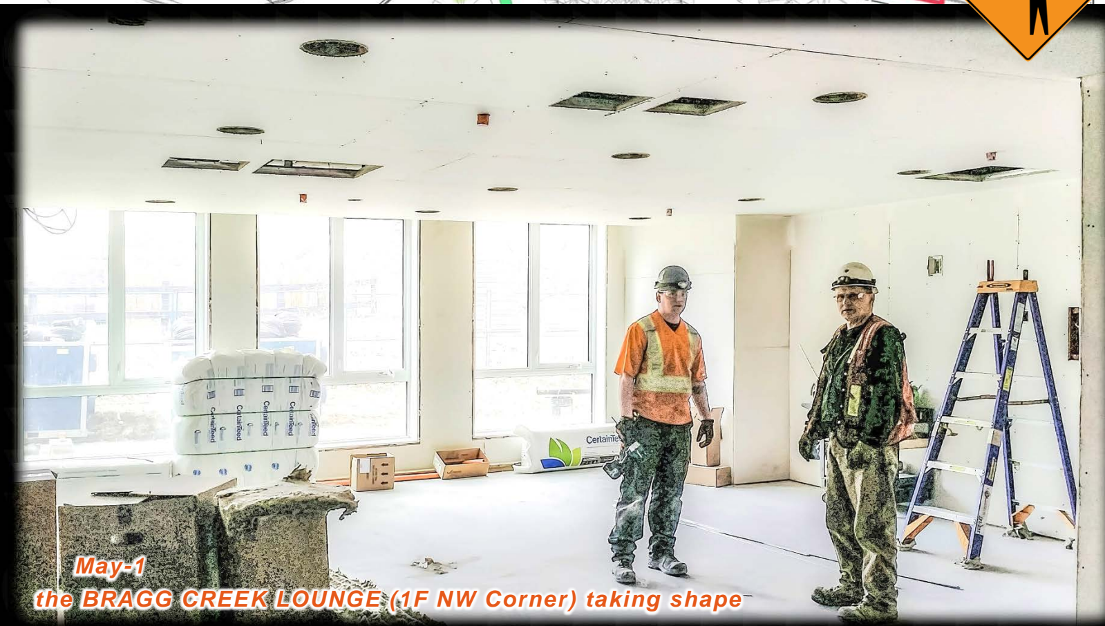
May-1 the BRAGG CREEK LOUNGE (1F NW Corner) taking shape