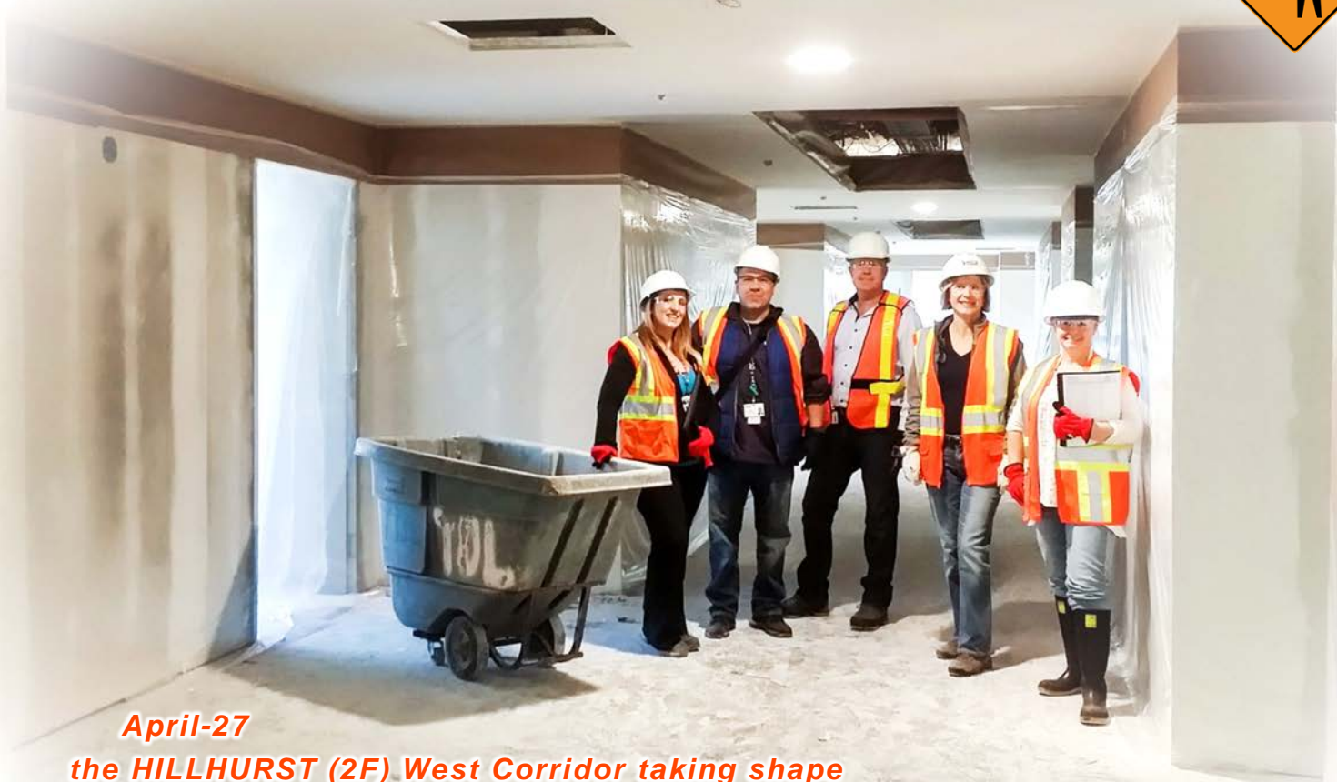
April-27 the HILLHURST (2F) West Corridor taking shape