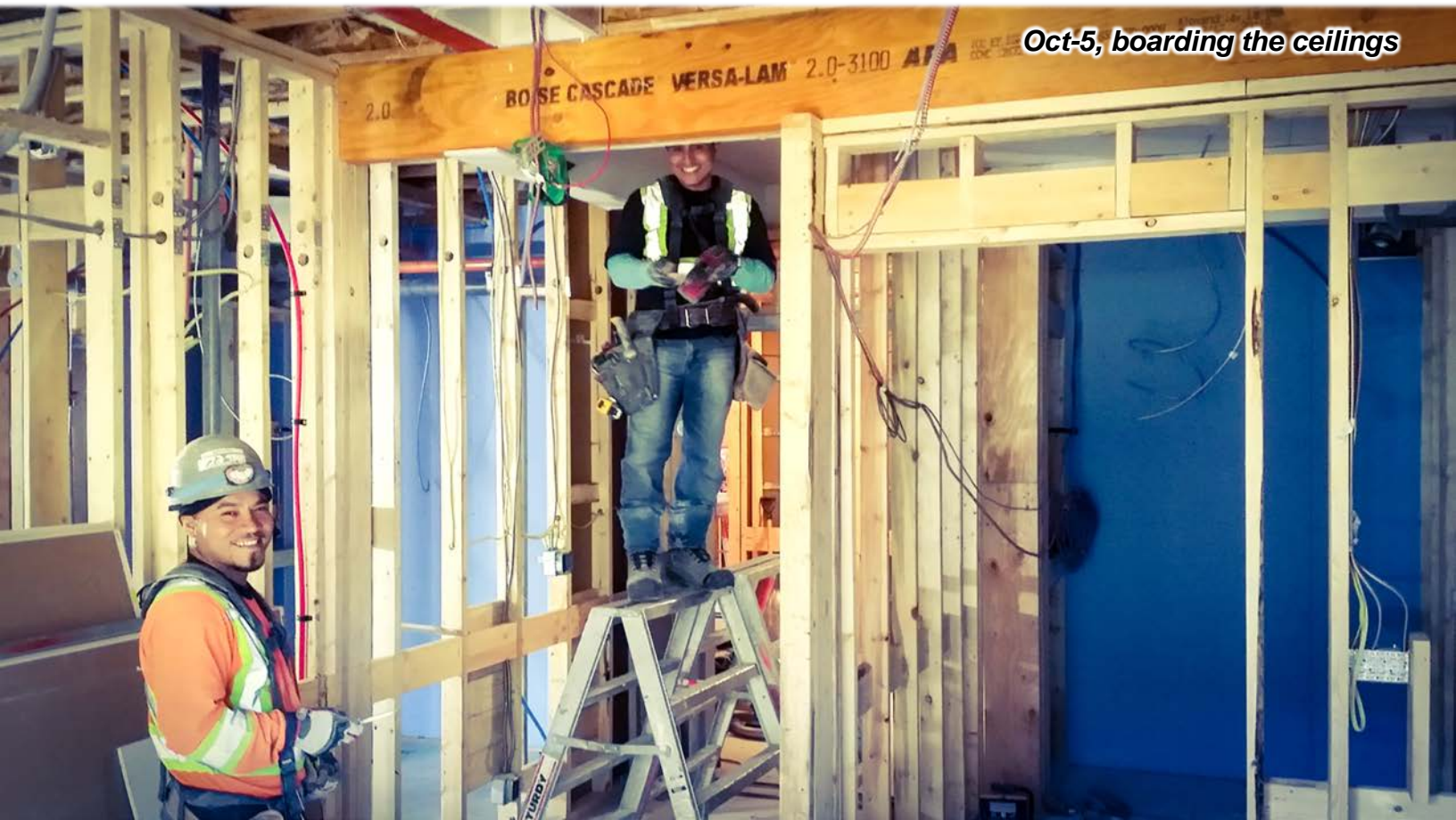
Oct-5, boarding the ceilings